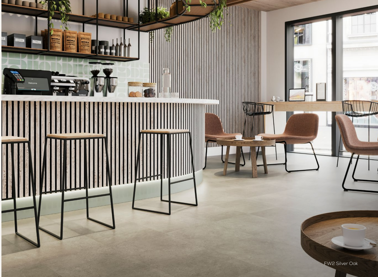
FW2 Silver Oak