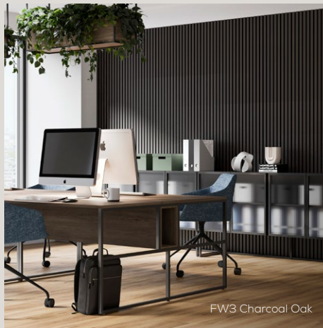
FW3 Charcoal Oak