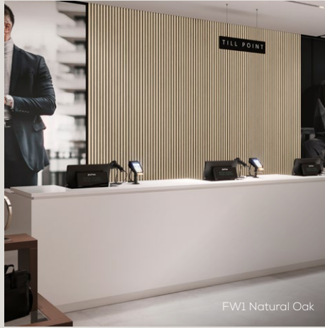
FW1 Natural Oak