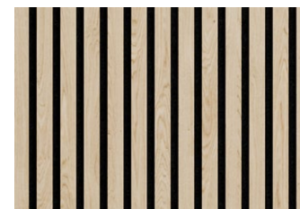
FW1 Natural Oak

Feature Wall is a decorative real wood veneer wall panel which is lightweight, easy to cut and install, and available in two sizes. The perfect solution for commercial or domestic use.