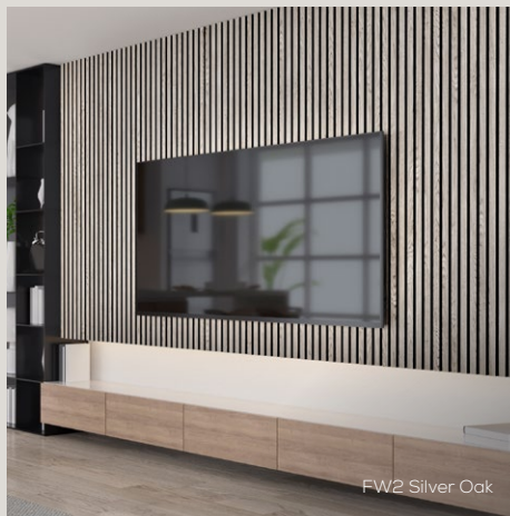
FW2 Silver Oak