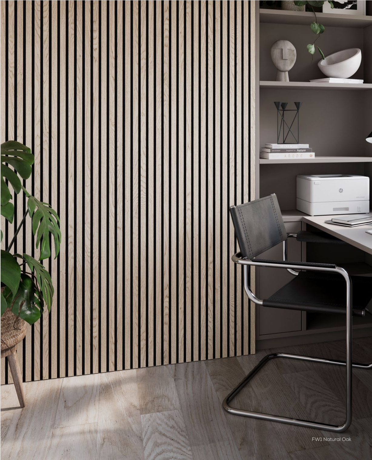
FW1 Natural Oak