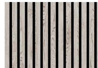
FW2 Silver Oak