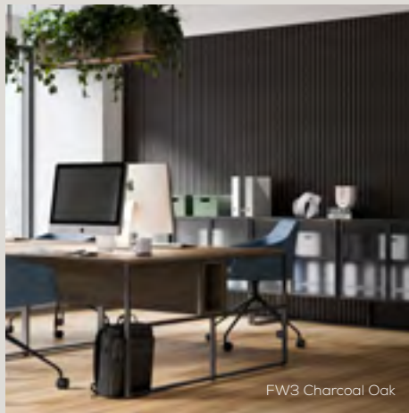
FW3 Charcoal Oak