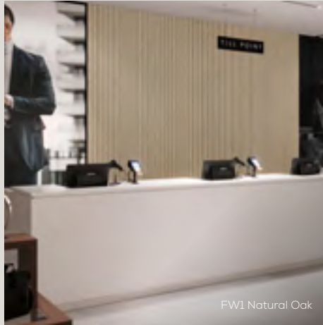
FW1 Natural Oak