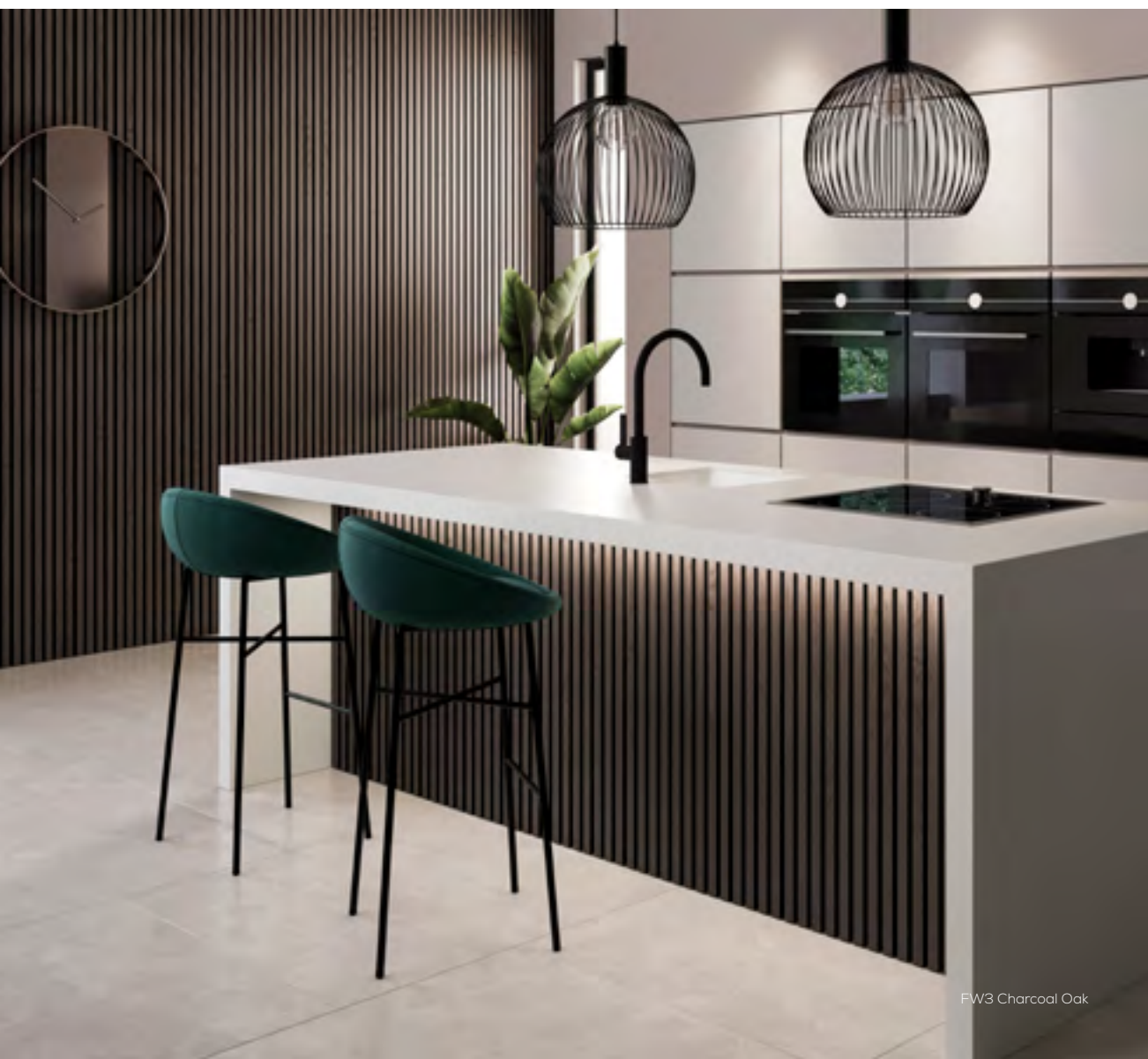
FW3 Charcoal Oak