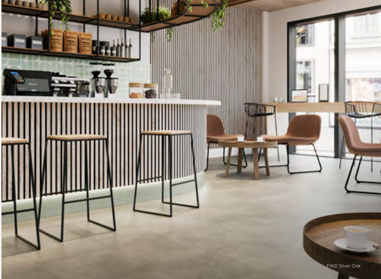
FW2 Silver Oak