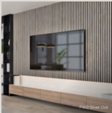
FW2 Silver Oak