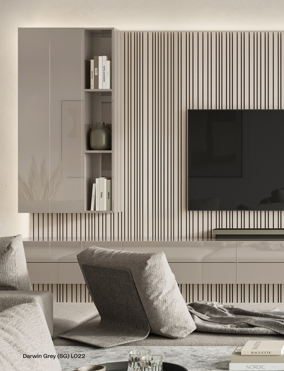
Darwin Grey (SG) L022