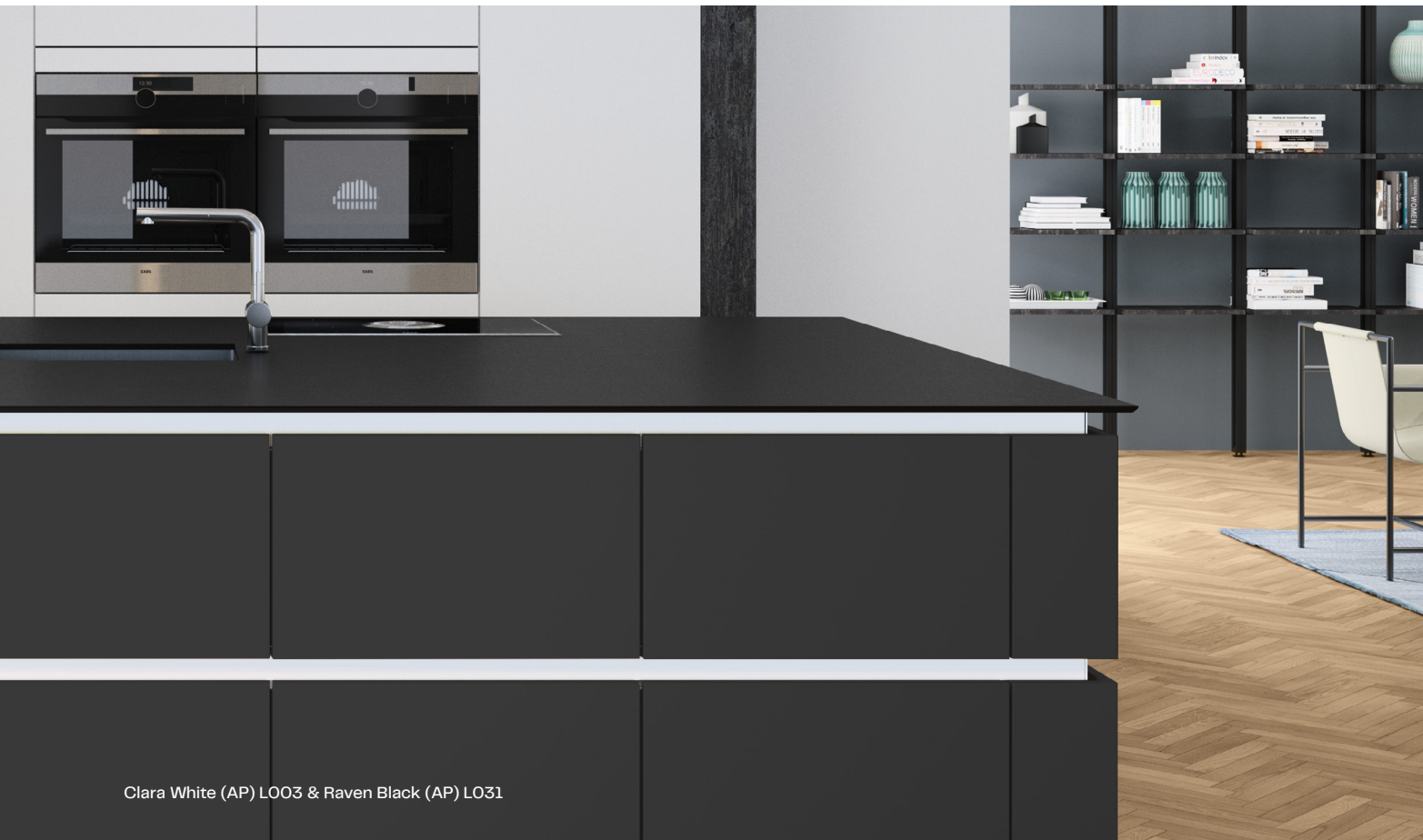
Clara White (AP) L003 & Raven Black (AP) L031