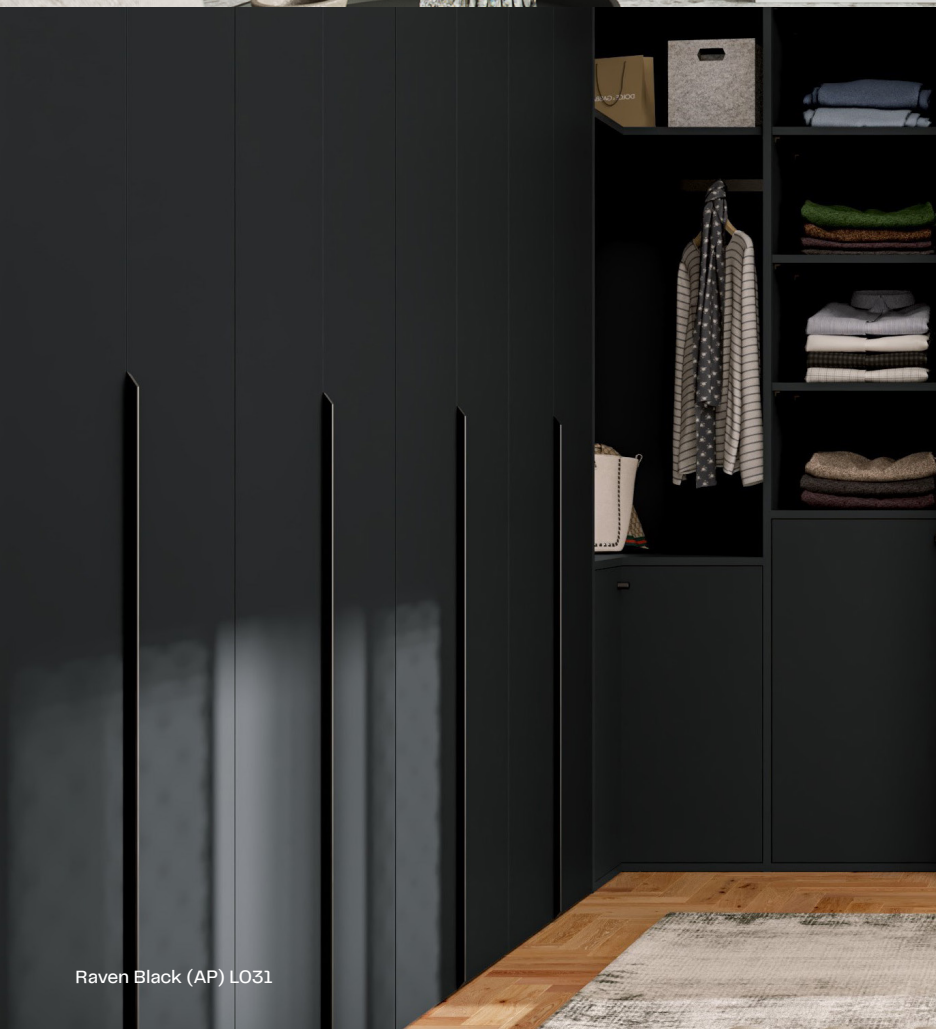
Raven Black (AP) L031