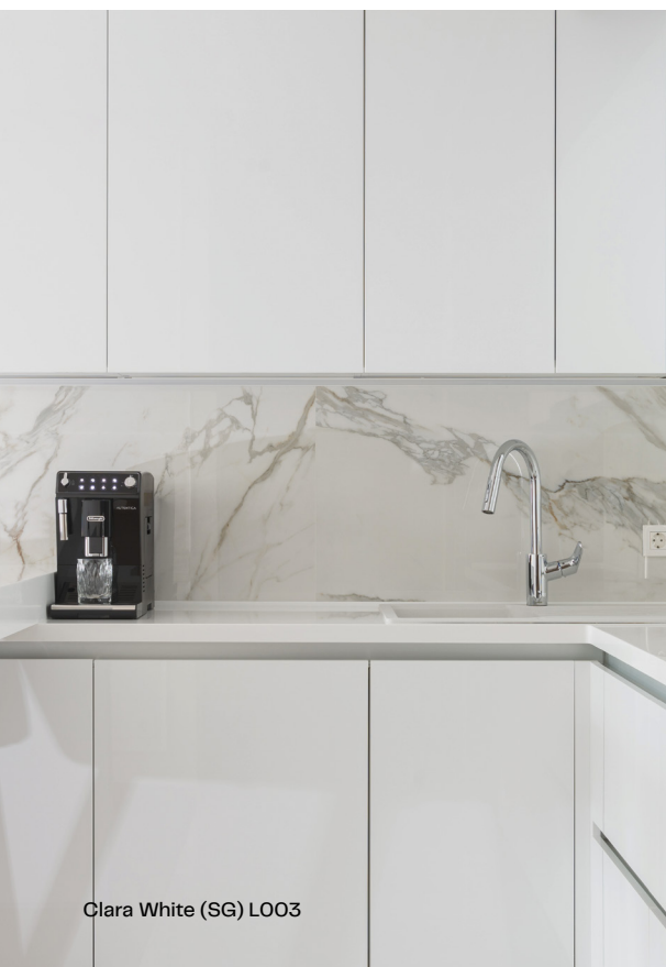
Clara White (SG) L003